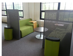
Salmon Arm in May?